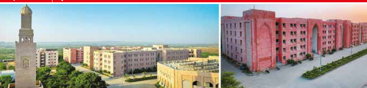
جامعہ بیت السلام کے باقاعدہ پر مشورہ، ایمان باندی و بی بی تعلیم سے تیسرے دستاویز اور فائدہ مند تھک بنیادی علمی تعلیم سے سائنس، ٹیکنالوجی اور سہولت مند مسلمان خواتین اور بچوں کو تعلیم دینے کے لیے ایک ایسی ادارہ ہے۔

بیت السلام ملت کو درپیش تقاضوں کے یقین مطابق وفاق تعلیمی وفاق کے ساتھ خدمات انجام دے رہا ہے۔