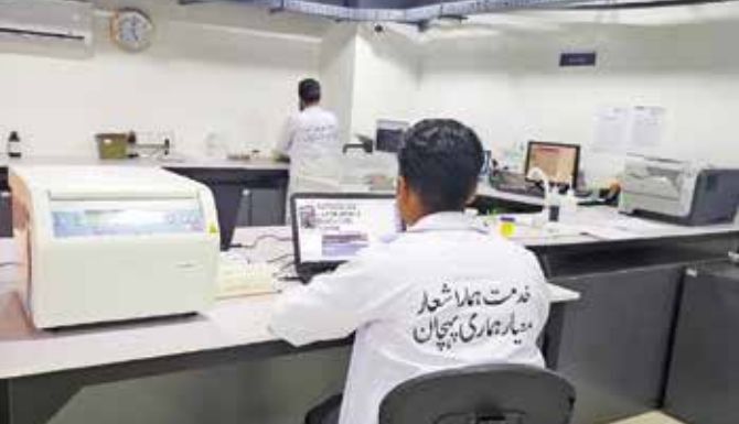
بیت السلام ایڈمیٹیو کا افتتاحی سہولت کے ساتھ شروع ہوا۔