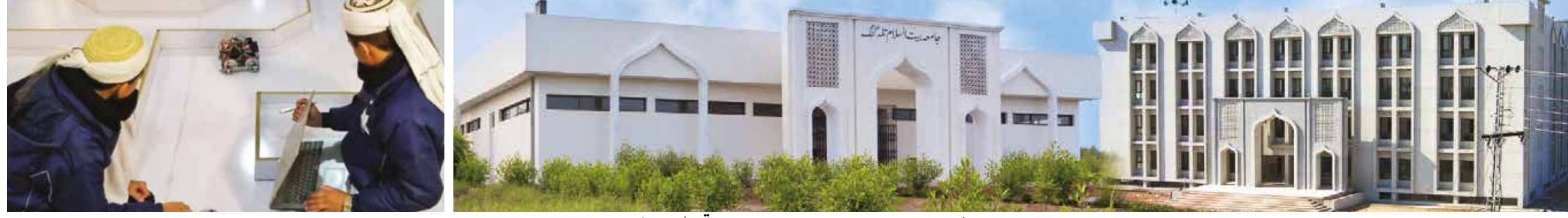
بیت السلام ایڈمیٹیو کا افتتاحی سہولت کے ساتھ شروع ہوا۔