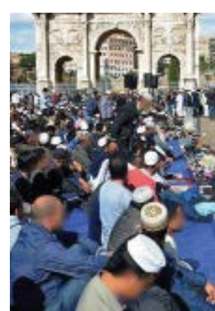
Muslims to worship at officially recognized mosques. Most worship takes place in houses and

A spokesman for the Lazio Muslim Association, said the community wanted urgent legal regulation to allow Italy's 1.6 million