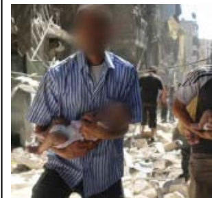
Britain is the latest country to acknowledge its participation in the airstrikes that reportedly killed scores of soldiers in the Syrian city of Dayr al-Zawr. The British Ministry of Defence (MoD) confirmed that UK drones participated in the

Australia and Denmark have also announced their aircraft were among a group of Western warplanes that targeted the Syrian forces.