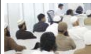
As the name indicates, Forward Institute has been established with

Bait-us-Salam Welfare Trust has added under feather in it cap in the form of and educational and learning based Institute called Forward.