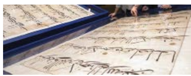
The last significant survey of Islam's holy book in the west was held at the British Museum in London in 1976. Into that void comes the first major

First major exhibit in the US, at the Smithsonian's Sackler Gallery in Washington, displays manuscripts over a period of almost a millennium.